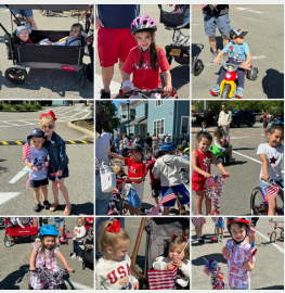
Memorial Day Kiddie Parade