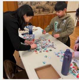
Puzzle Night Challenge