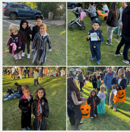
Fun Fall Festival