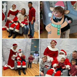
Breakfast with Santa & Mrs. Claus