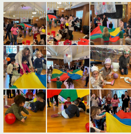
New Year's Eve Noon Bash